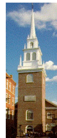
Boston -Old North Church

This trip departs from Bismarck with pick up in route along I 94!