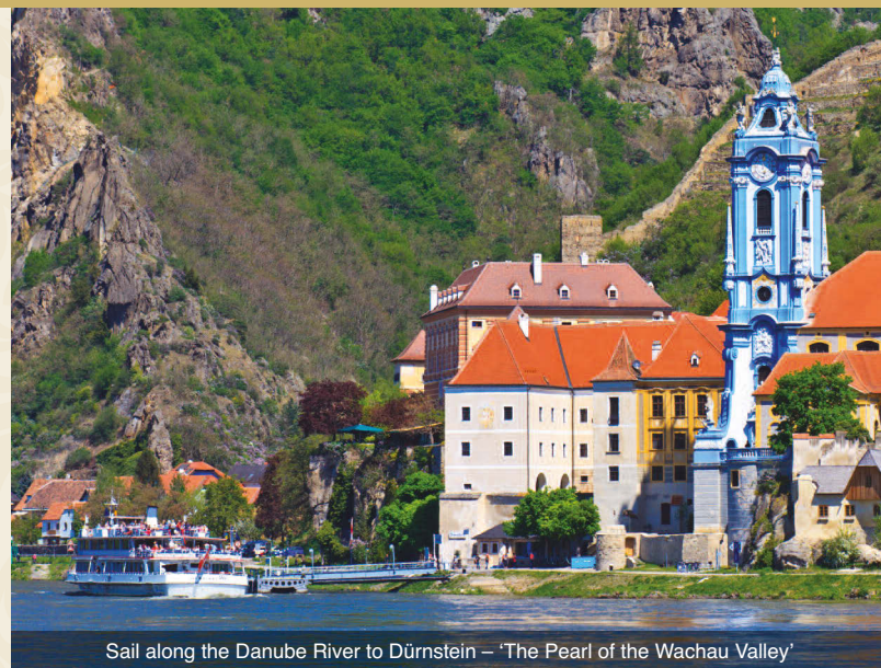
Sail along the Danube River to Dürnstein – 'The Pearl of the Wachau Valley'

Ludwig' as you explore the interior of this amazing castle. Stunning views of the surrounding countryside await as you peer from the portals of the castle. After the visit, you'll be transferred back down the hill, and continue your journey to Salzburg for 3-nights' accommodations. Meal: B