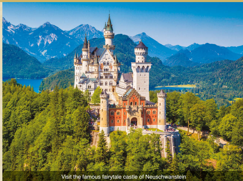
Visit the famous fairytale castle of Neuschwanstein

Days Eight and Nine – Hotel AT Savoyen, or similar, Vienna, Austria