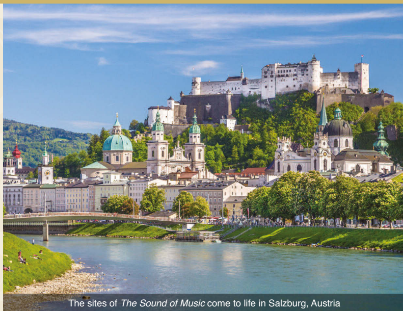
The sites of The Sound of Music come to life in Salzburg, Austria