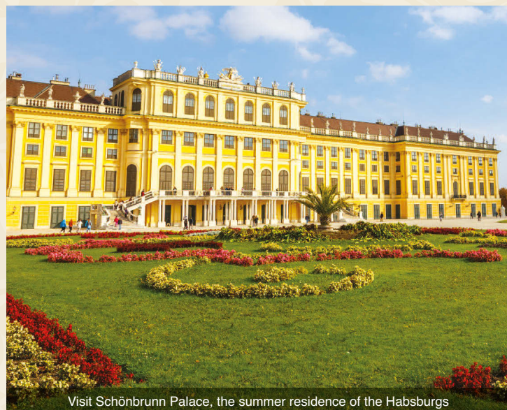
Visit Schönbrunn Palace, the summer residence of the Habsburgs