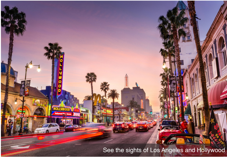
See the sights of Los Angeles and Hollywood

the precision of the marching bands and the equestrian teams as you become part of an event that is seen throughout the world by millions. In the afternoon, head back to the hotel where a special Tailgate Party awaits. Watch the Rose Bowl football game and cheer on the teams while enjoying a Tailgate lunch. Meals: B, L