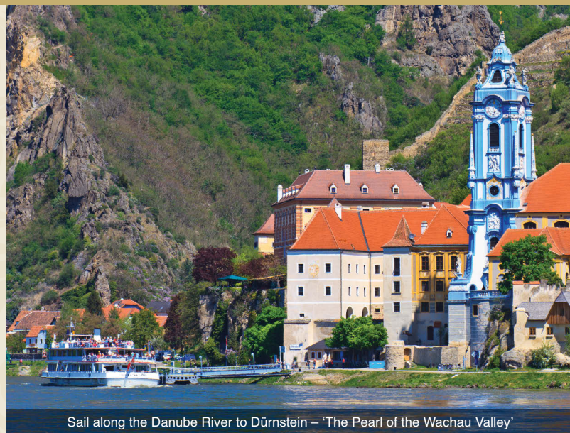
Sail along the Danube River to Dürnstein – 'The Pearl of the Wachau Valley'

Departing Salzburg, today's adventure unfolds with the exploration of the sites and cities of the Danube Valley. Enroute to Vienna, visit the famed Melk Abbey, a UNESCO World Heritage Site, majestically towering over the Danube River. The Abbey provides a sweeping panorama of the Lower Alps and is one of the most significant Baroque-style building complexes in Europe. During the guided visit, see the Marble Hall and the Library with thousands of identically bound books. The highlight of the visit will be the Abbey Church, regarded as the most beautiful church in the world. There's no better way to experience the Danube Valley than on a boat ride between Krems and Dürnstein. Remarkable scenery awaits! Following the cruise, re-board the coach and continue to Vienna. Meal: B