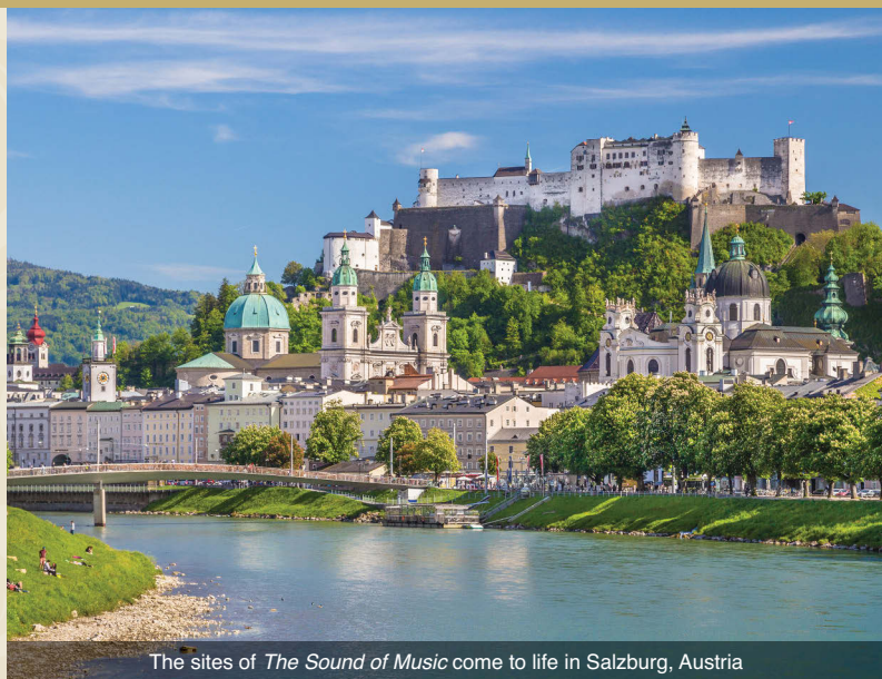
The sites of The Sound of Music come to life in Salzburg, Austria

Ludwig' as you explore the interior of this amazing castle. Stunning views of the surrounding countryside await as you peer from the portals of the castle. After the visit, you'll be transferred back down the hill, and continue your journey to Salzburg for 3-nights' accommodations. Meal: B