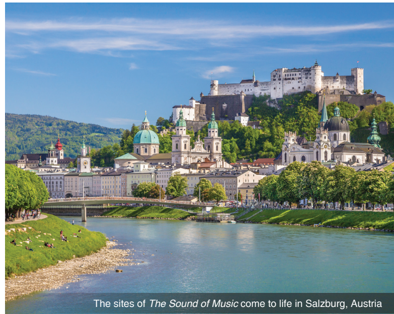
The sites of The Sound of Music come to life in Salzburg, Austria

DAY 1 Depart the USA: Today you'll depart on your overnight flight to Munich, Germany – the capital of Bavaria.