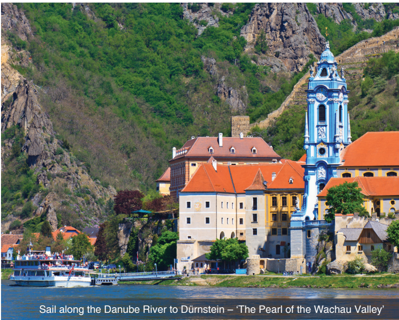
Sail along the Danube River to Dürnstein – ‘The Pearl of the Wachau Valley’

scenery awaits! Following the cruise, re-board the coach and continue to Vienna. Meal: B