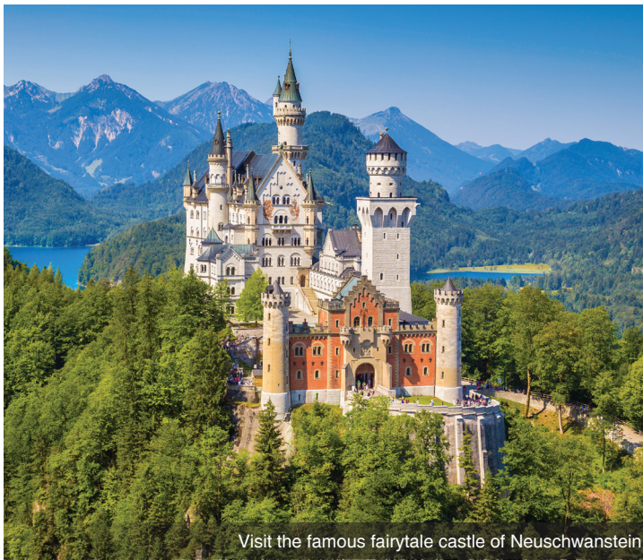
Visit the famous fairytale castle of Neuschwanstein