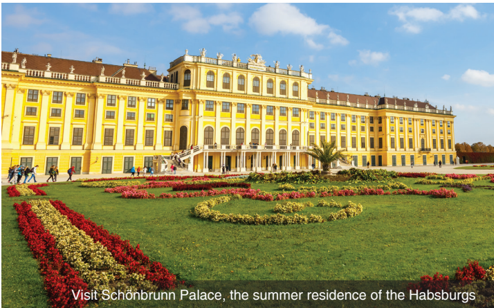
Visit Schönbrunn Palace, the summer residence of the Habsburgs