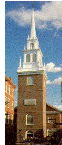
Boston -Old North Church

This trip departs from Bismarck with pick up in route along I 94!