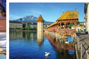
Lucerne on Rhine River