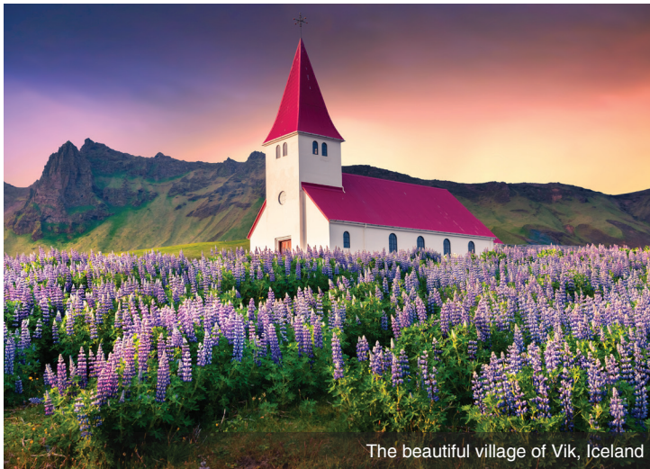
The beautiful village of Vik, Iceland