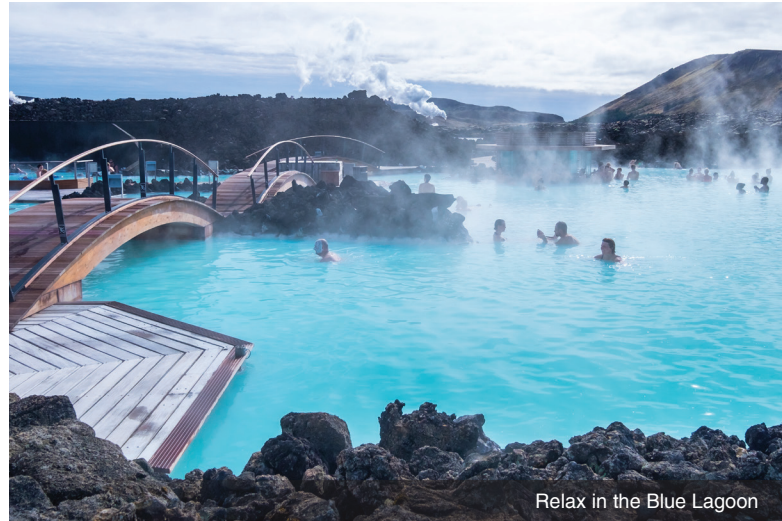
Relax in the Blue Lagoon

DAY 1 Depart the USA: Today you'll depart the USA on your overnight flight to Keflavik, Iceland.