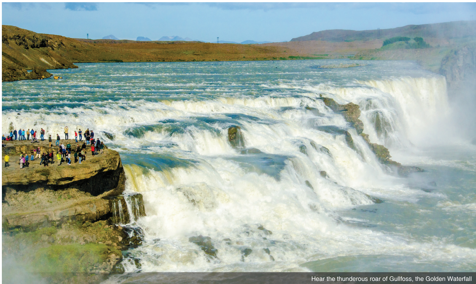
Hear the thunderous roar of Gullfoss, the Golden Waterfall